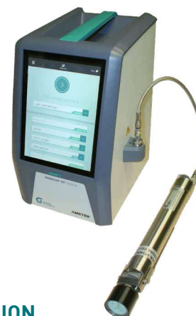
VP VISION Crude Oil Package