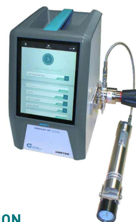
VP VISION High Pressure Pipeline Package