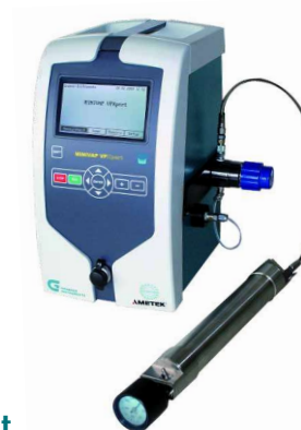
VPXpert Crude Oil Package